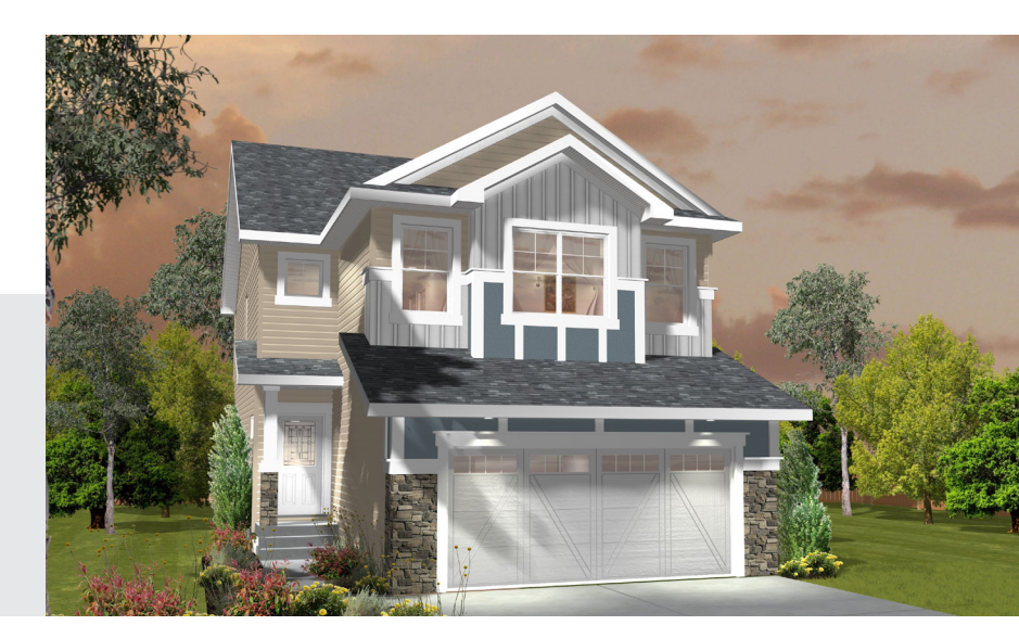
Seville H 1980 SQ FT 57 Memorial Parkway