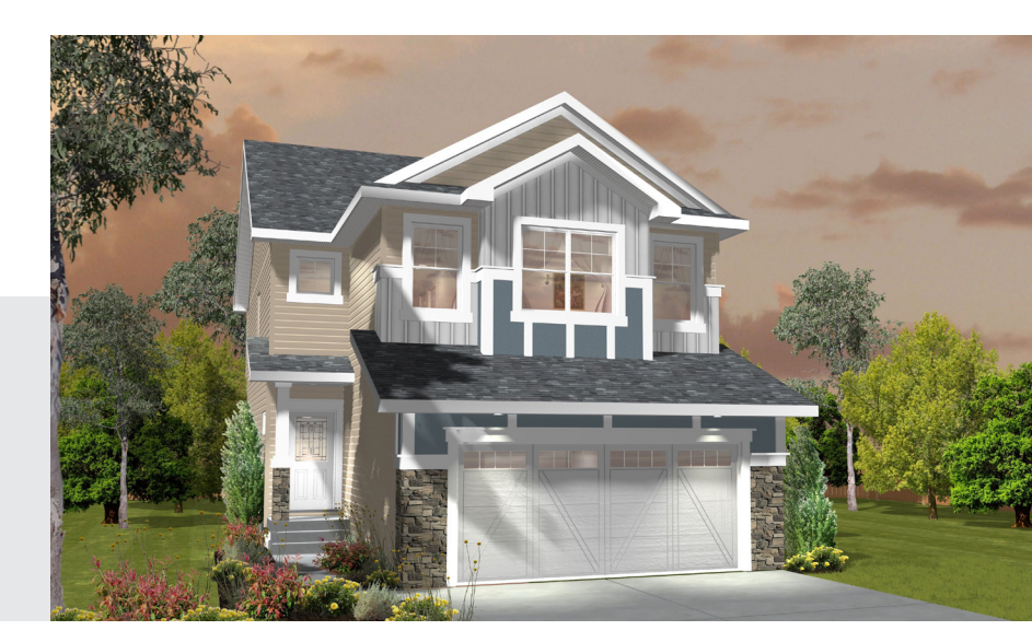
Seville H 1980 SQ FT 57 Memorial Parkway